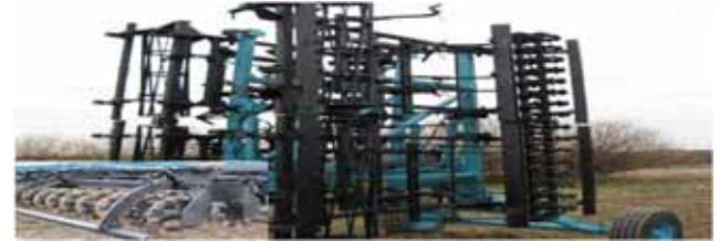
Discopak units type D