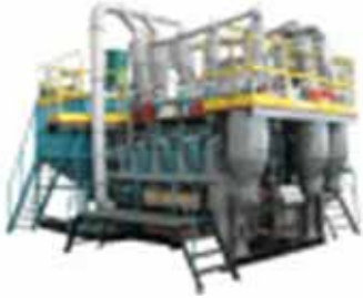
Modular roller mills