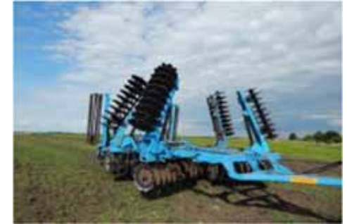
Spring-wide harrows SWH